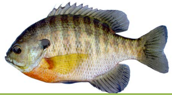
Bluegill ( Lepomis macrochirus )